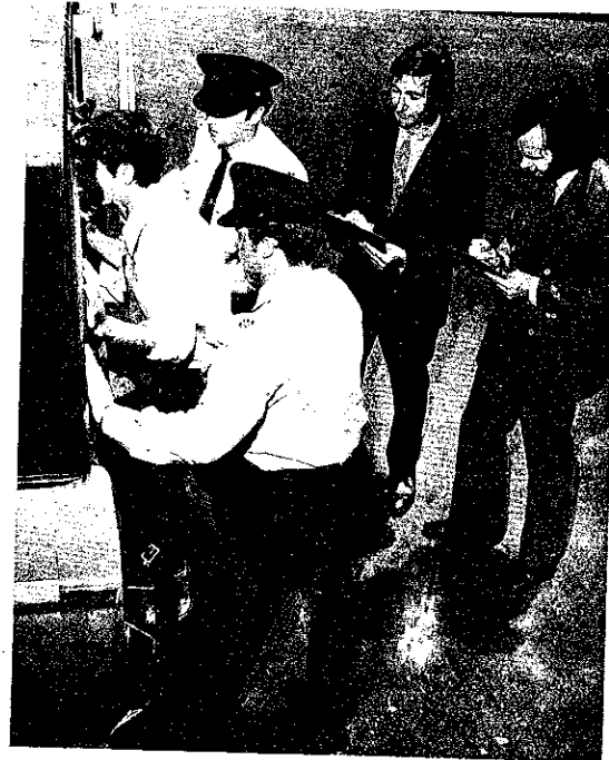
Costing present procedures

The estimated annual cost of involving the police, courts and prisons in the legal processing of drunks apprehended within the inner-Sydney area is $122,000 (see accompanying map of the area involved). The subsidy required to cover the salaries of the director, welfare coordinators, nurses, medical orderlies and secretary of the intake centre is estimated to be $75,000 per year. In addition, it would be necessary to purchase and maintain the two radio-controlled vehicles which are necessary for the successful operation of the centre.