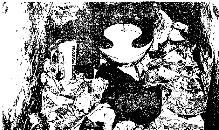
Home for three city drunks